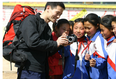
Volunteer sharing pictures

Yu began to rethink his voluntourism model. When the materials to school, they also communicate with the sharing photos for example. At the same time, collect the information of new rural schools they see in help the expansion of 1KG More. When they are in the volunteers share their experiences and information with More's website and encourage more people to voluntourism. Developed from the original single platform, 1KG More's sustainable voluntourism model It comprises: